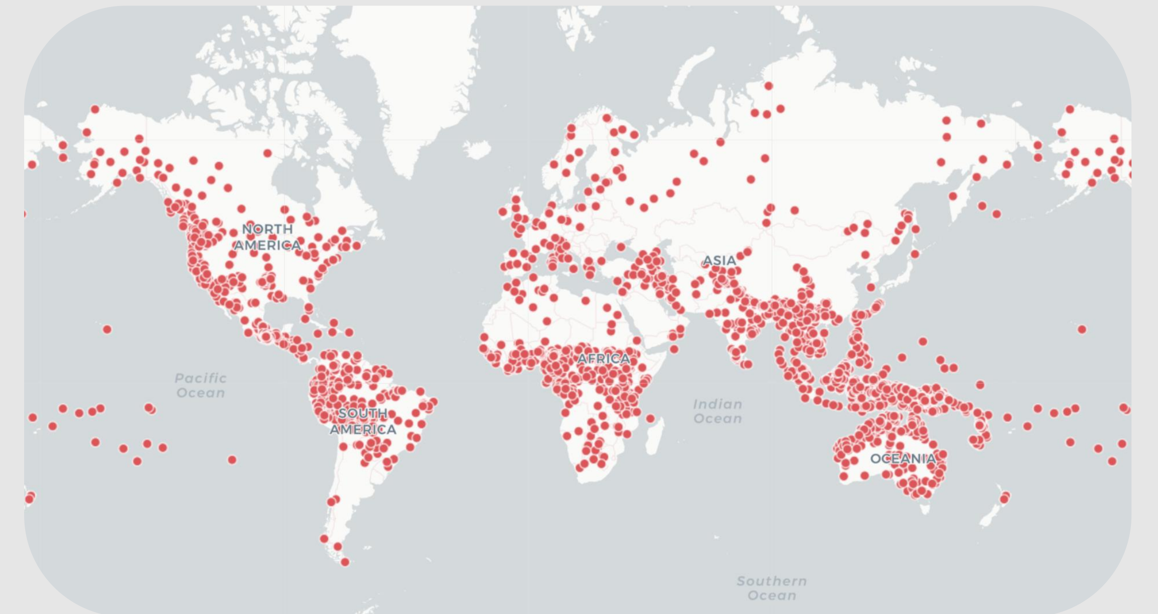
Endangered languages (map by Ethnologue by SIL International)